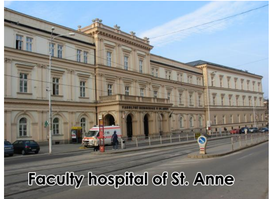
Faculty hospital of St. Anne

CLINICAL EDUCATION TAKES PLACE AT BOHUNICE FACULTY HOSPITAL, CHILDREN'S MEDICAL CENTRE, AND ST. ANNE'S HOSPITAL